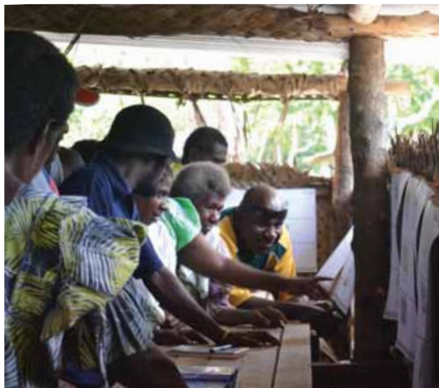
Community consultations conducted in Vanuatu. Feedback was incorporated into the final products.

The animation project benefitted greatly from a dedicated Australian Red Cross volunteer who worked for 12 months on the project at the Vanuatu Meteorology and Geohazards Department office. The consultation and coordination required were far greater than was ever envisaged, and having a dedicated coordinator meant the project kept to deadlines. For many team members the project was only one of the many projects on their agendas, and it required ongoing commitment and constant input for more than one year.