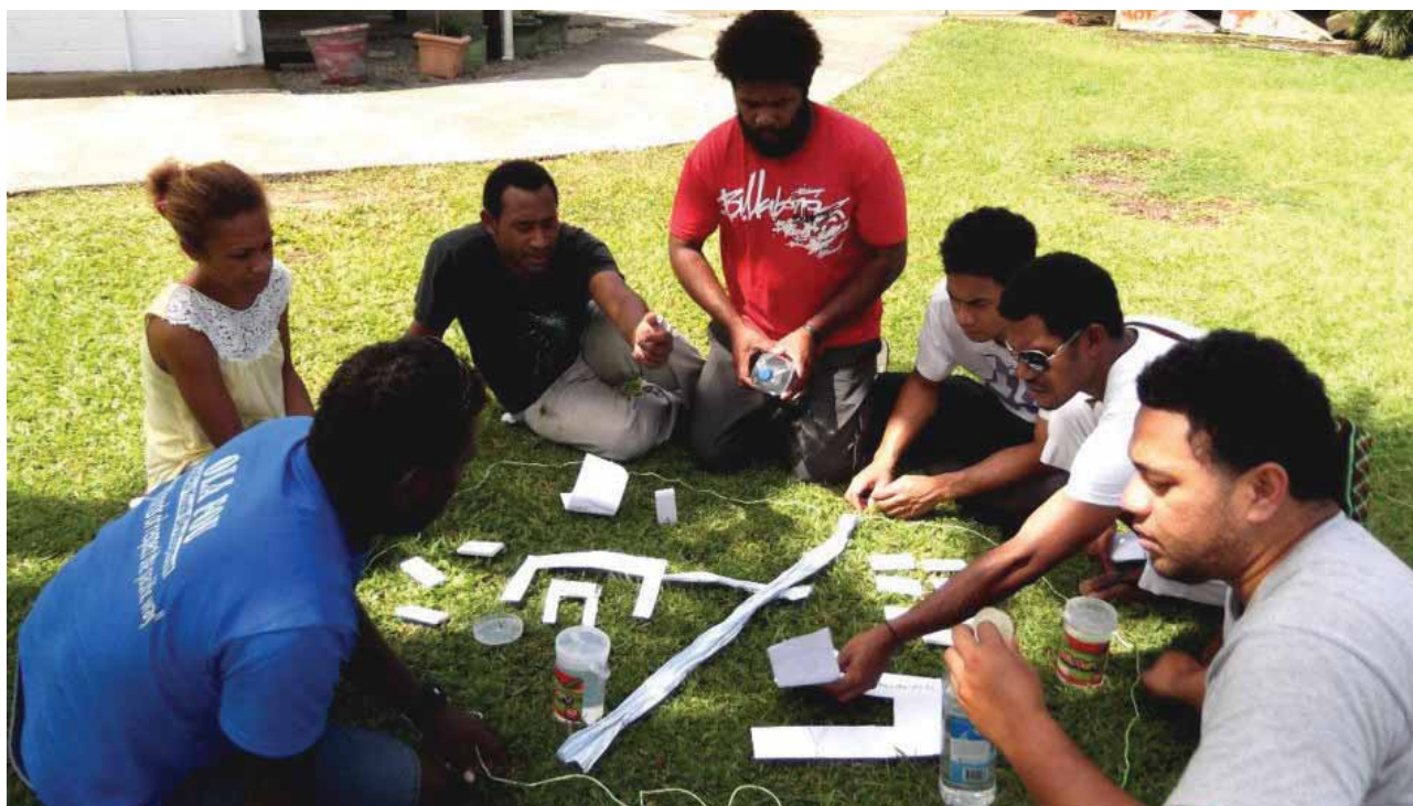
Hazard vulnerability identification with youth workers from Solomon Islands, Papua New Guinea, Vanuatu, Fiji and Tonga during training in Deuba Fiji.

A key method of preparedness is raising awareness around disasters and understanding local strengths and vulnerabilities.