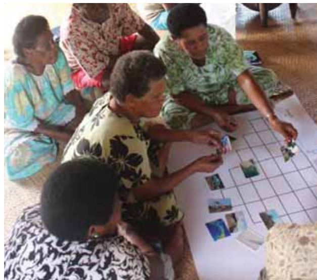
Community survey in Navutulevu, Fiji.

The project aimed to contribute to both analytical research and ideas on how key target sectors interact, in addition to provide tangible tools to teachers and communities for facilitating increased interaction through education.