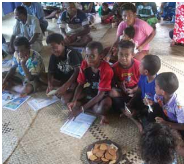
Climate awareness meeting at Kalekana Community Hall, Lami, Fiji.

Lami Town is located on Viti Levu in Fiji, and is considered part of the greater Suva area, occupying the inshore coastline of Suva Harbour. Lami Town and adjacent peri-urban areas comprise a mixture of formal and informal settlements with approximately 21,000 people. Located in a mountainous coastal zone with steep hills and three rivers flowing to the ocean, the town is highly vulnerable to flooding and erosion. The natural protective resources available are mangroves, coral reefs, seagrass and mudflats. In order to address the current and future impacts of climate change, Lami Town partnered with UN Habitat's Cities and Climate Change Initiative to enhance policy dialogue awareness, education and capacity building. The aim is to firmly establish climate change within the towns corporate plan (annual), strategic action plan (five years) and the Lami Town Planning Scheme to support their efforts to bring about changes for adapting to climate change.