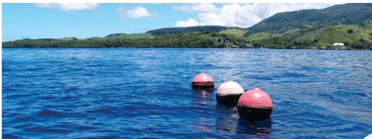
A submerged fish aggregation device (FAD) in Qarani, Gau.

Awareness and empowerment of local communities are necessary to attain the desired changes that are needed.