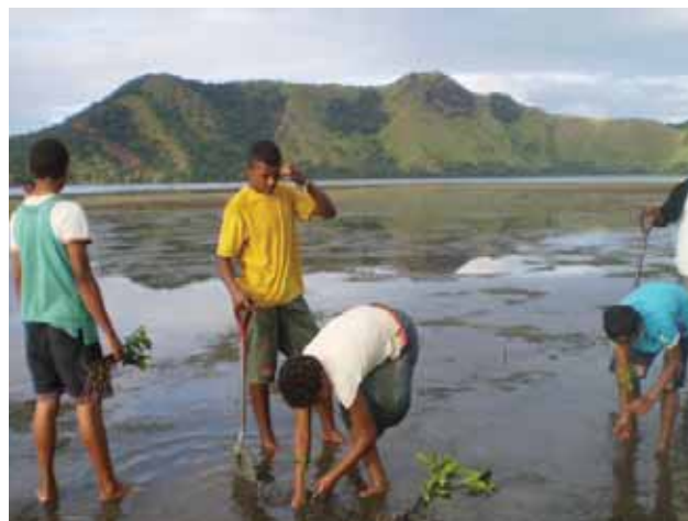
Gau Secondary School students planting mangroves in Nawaikama, Gau.

The Lomani Gau project encourages local communities to care for and sustainably use their environment and natural resources that they depend on for sustenance and income generation. The project promotes integrated resource management to secure alternative sources of livelihood that can support the people's sustainable development aspirations.