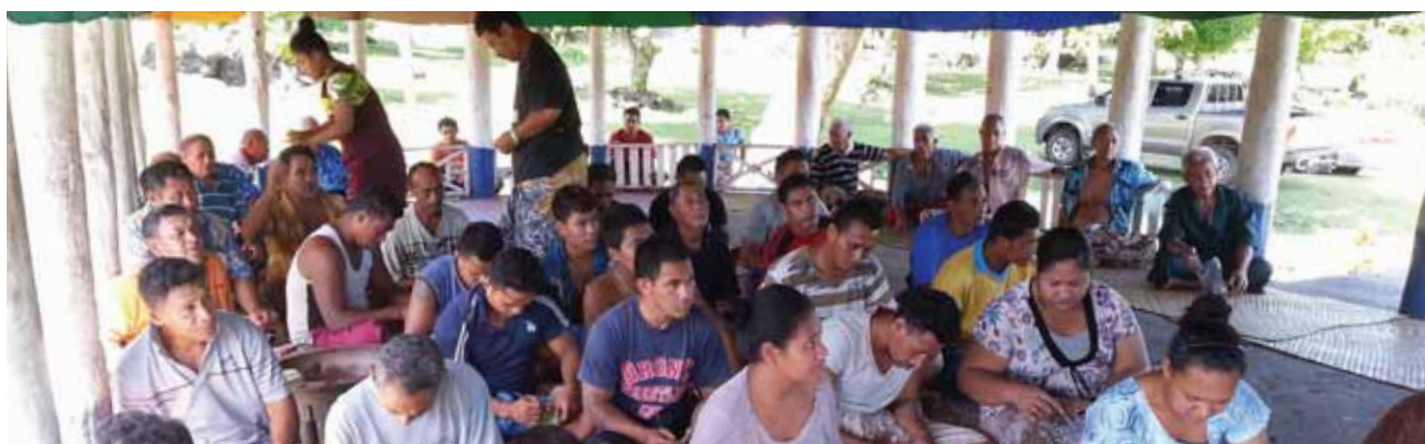
Community survey in Savai'i, Samoa.

The social perceptions, cultures, norms and environmental conditions of communities should be factored when designing tools, methods and policies for effective adaptation and resilience to climate change.