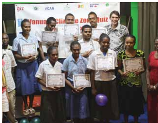
A new SMS 'public - private partnership' competition was part of the annual Vanuatu Climate Zone Quiz.

In Vanuatu, the establishment of the National Advisory Board (NAB) in 2012 has gone some way to improving the management of CCDRM initiatives. PRRP is working with the NAB to further strengthen 'risk governance' through the integration of CCDRM into development, particularly within national development planning processes across all development sectors (with a focus on agriculture and education), and sub-national level development planning in target provinces and communities.