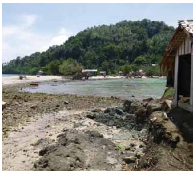
Nuatabu Village identified as suffering from coastal erosion issues by Province -wide Vulnerability and Adaptation Assessment.

Programmes must coordinate exit strategies with national and provincial stakeholders to facilitate successful approaches and adaptation interventions that are sustained and up-scaled.