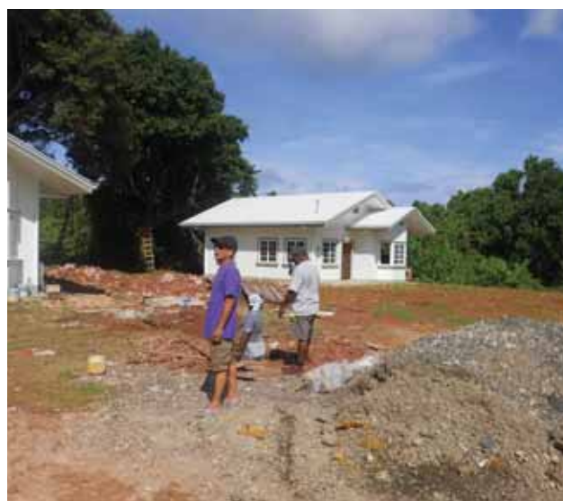
Newly constructed energy efficient housing in Palau.

Energy efficiency measures are less expensive with more immediate results than other greenhouse gas emission reduction options.