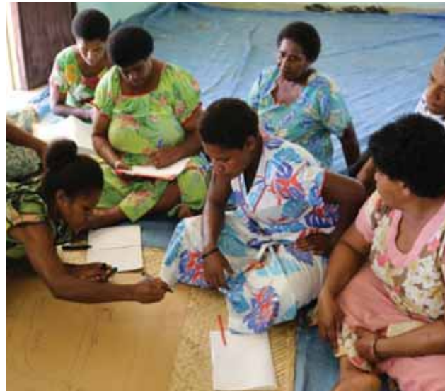
Community members developing their own hazard maps.

In response to these challenges, the Government of Fiji requested support from the Government of Japan and the Strengthening of Community-Based Disaster Risk Management Project was developed across the Pacific Region. Japan International Cooperation Agency (JICA) implemented the pilot project in Ba, Northwest of Viti Levu Island of Fiji to develop a system in which the residents of the selected community areas are able to evacuate appropriately in time of disaster.