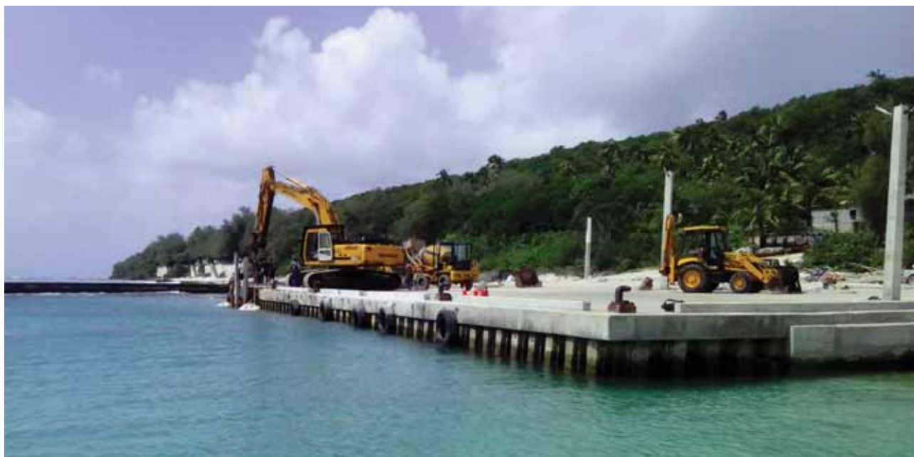
Construction at the Mangaia harbour, Cook Islands.

Good communications and collaboration with other government agencies is also important, to keep everyone updated and informed, and also to optimise opportunities to work together. For example, the project worked closely with the Ministry of Internal Affairs (Gender Division) to incorporate gender perspective into the project.