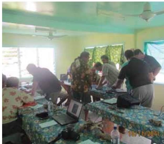
Community meeting to obtain local knowledge regarding extent of storm surge and cyclone wave run-up around Mangaia.

The aim of the Pacific Adaptation to Climate Change (PACC) project is to contribute to reduced vulnerability and increased adaptive capacity to adverse effects of climate change in the Cook Islands. In order to achieve this the project aimed to develop a stronger and safer harbour that can withstand current and future climate-related threats. In parallel, the project has helped to develop an integrated coastal management policy and plan for Mangaia.