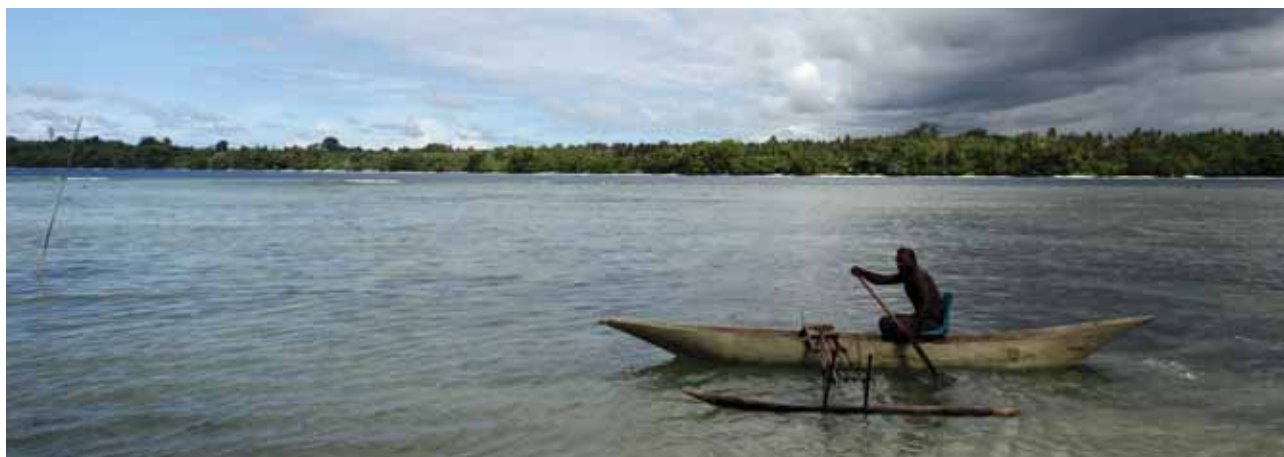
Nissan District, Papua New Guinea.

Trends, challenges, solutions and lessons are drawn from these case studies, which may serve as a guide for the design of future initiatives to be implemented under the SRDP and provide a reference for the Pacific and other regions of the world. This compendium refers to lessons learnt as knowledge acquired from observations and experiences. Lessons in this compendium may arise from positive or negative experiences. In both cases, these have led to insights which may benefit the development of future initiatives for climate and disaster resilience.