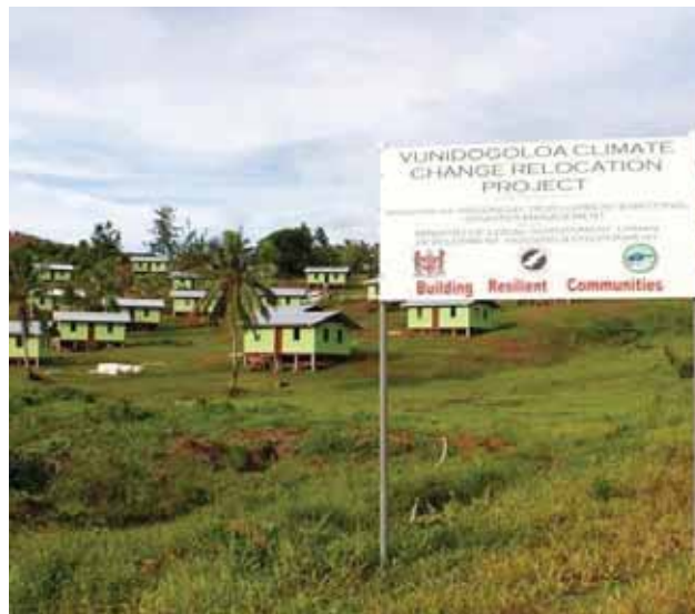
Relocated Vunidogoloa village in Vanua Levu, Fiji.

Vunidogoloa village was identified for relocation in 2010 by the Government of Fiji after the events of Tropical Cyclone Tomas. It was noted from preliminary inspection that the village was succumbing to flooding during heavy rain and high tide. This raised health concerns due to the lack of waste disposal management and community housing rotting. Due to such impacts, a new village location over the hill (2kms inland) known as Cevuvu Settlement was identified alongside the main Saqani Road.