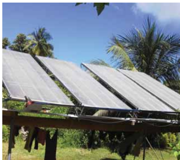
Solar panels installed for water purification in Nauru.

As water is one of the most vulnerable resources in the Pacific to climate change, priority must be given to establish the maintenance and operational support systems required to address and respond to a healthy and sustainable water sector. Setting up of an institution or management unit focusing solely on water, is a good governance practice that must be established immediately if not already in place.