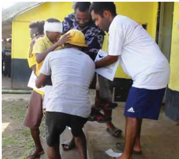
Simulation exercise with staff and students of Erakor Bilingual School.

The project leveraged the interest of school principals and teachers as well as the energy and enthusiasm of children and youth to address these issues. Rather than focussing on the production of planning documents, the strategy focuses on good guidance and a series of all-school activities designed to produce a plan-in action.