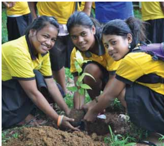
Sekere Elementary School, 8th Grade students planting to reduce risks of landslide on their campus.

The Climate Adaptation, Disaster Risk Reduction and Education (CADRE) programme originally started as a small scale pilot program for six schools in Pohnpei funded by the United States. There was a Pacific Wide Tsunami alert and the United States ambassador was aghast that many people in Pohnpei did not respond appropriately to the alert and were not aware of what to do in the case of a tsunami threat. The International Organisation for Migration (IOM) was asked to develop a public awareness raising program and also to work with schools on safety programming to address natural hazards. The pilot program enjoyed great success and Australia saw the potential to make a more comprehensive program to improve DRM in the region.