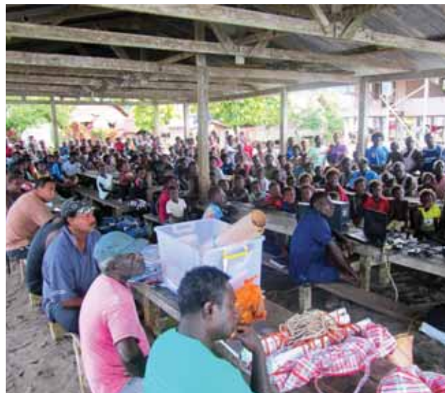
Vulnerability assessment in Choiseul.

In 2012, the Government of the Solomon Islands proposed to adopt a more integrated and holistic approach to CCA and mitigation at the province-wide level to help improve coordination and alignment of support, as well as the impact of planned development interventions. An integrated, programmatic ridge-to-reef approach was envisaged where government agencies, development partners and non-government organisations work in a multi-sectoral 'programme' in one province to strengthen the resilience of the local population against climate change. Choiseul Province was selected for trialling this new approach.