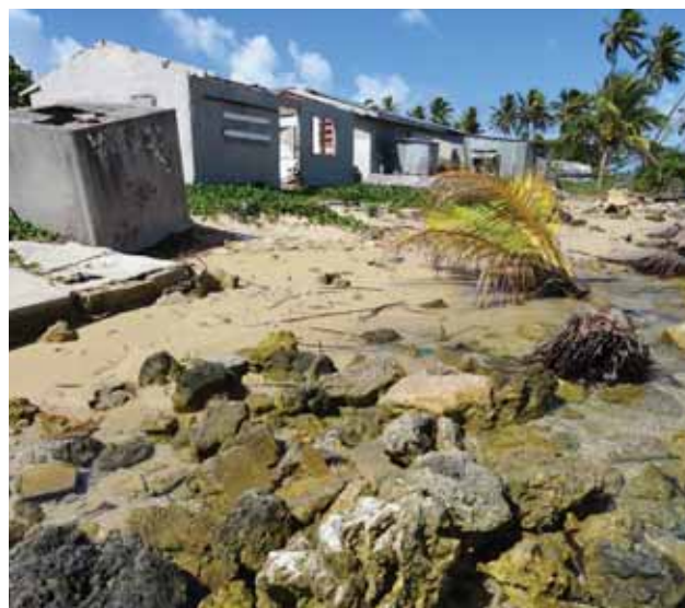
Damaged coastline and houses, Lifuka, Tonga, March 2012.

The project was developed and implemented as a partnership between the Australian Government's Pacific Adaptation Strategy Assistance Program (PASAP), the MLSNRECC, the Secretariat of the Pacific Community (SPC) and the Tonga Community Development Trust.