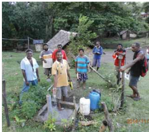
Community members in Wilit, North Ambrym enjoying piped water from a protected water source.