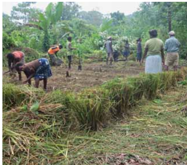
Participants learn about climate-smart vegetable production.