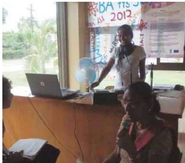
Taking the 'suitcase radio' out to women in rural centres brings women together through pre broadcast consultations and on the airways.

Radio is one of the cheapest mass medium, reaching out to large numbers of people in isolated areas. It has been used to disseminate information and early warning messages. Radio, especially community radio, has proven to be an effective tool for disaster management as it is an efficient means to deliver information suited to the needs of the community, packaged in local language.