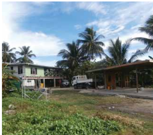
Site for installation of on-grid solar PV system.

The Tuvalu Photovoltaic Electricity Network Integration Project has been set up to fulfil electricity needs for the school while reducing Tuvalu Electricity Corporation's dependence on imported diesel, therefore, contributing to Tuvalu's plan of combating the escalating price of imported fuel, particularly for the island of Vaitupu. Tuvalu has a target of obtaining 100% of its electricity generation from renewable energy sources by the year 2020.