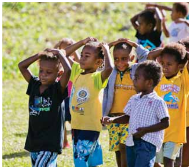
School children undertaking evacuation exercise.

The Enhancing Emergency Preparedness and Disaster Risk Reduction Strategies in Fiji, Tonga and Vanuatu project aimed to reduce the loss of life and economic impact of disasters through the strengthening of disaster preparedness and response plans in advance of disaster events. The project supported the running of disaster preparedness and response simulation exercises.