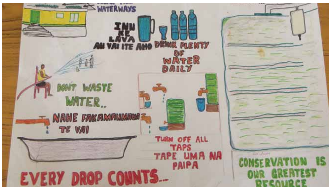
Winning poster in school competition which is part of the PACC project's awareness raising.

People in the Pacific know about the climate and have witnessed changes. So climate change should be related to what they know, rather than presented as a new issue.