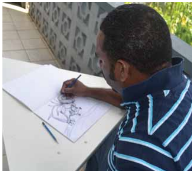
Many of the films' characters were conceptualised by Vanuatu based artist Joseph Siri, based on ideas generated by stakeholder workshops.

Research by the Red Cross Climate Centre found that, globally, there are few simple films on ENSO for use in training and planning. The Pacific Climate Animation Project, funded by the Australian Government Pacific Australia Climate Change Science and Adaptation Planning (PACCSAP) science program, aimed to increase awareness of the science of El Niño and La Niña and their impacts, and encourage discussion about how Pacific nations can access forecast information, communicate and work together to take early action to prepare for future El Niño and La Niña events. Complex concepts, such as ENSO and other climate drivers have been difficult to present to audiences using inanimate descriptions and photographs.