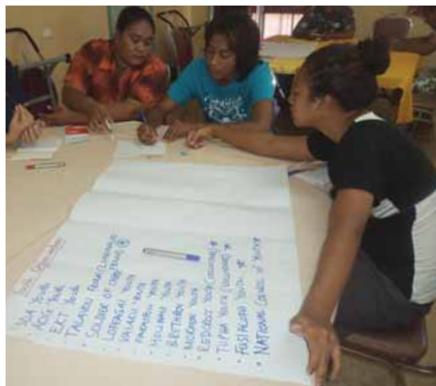
Inclusion of young people in DRR and CCA community planning in Tuvalu.

Monitoring and evaluation should not only foster compliance but also support learning.