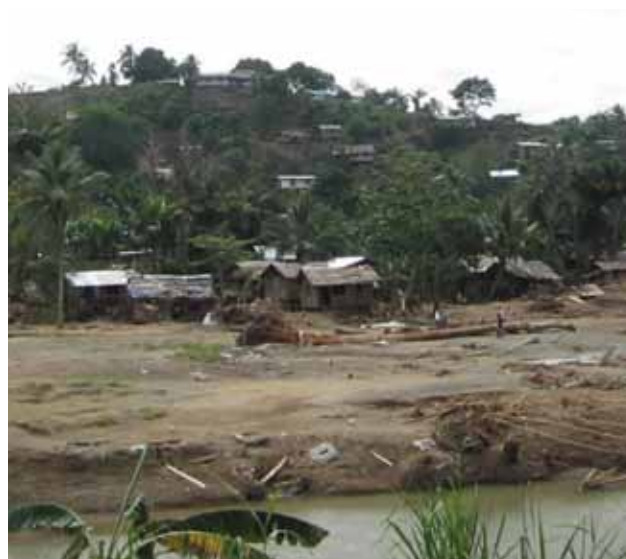
Damage to along the banks of the Matanikau River, Honiara, Solomon Islands after the 2014 floods.

As seen from the payout to Tonga following Tropical Cyclone Ian, catastrophe risk insurance can be highly beneficial. However, it requires technical expertise and coordination among participating countries. A challenge for the future is to determine how the insurance coverage might be extended to cover other forms of disaster risks, including the flooding and droughts that periodically impact all PICs, not just those prone to tropical cyclones and tsunamis.