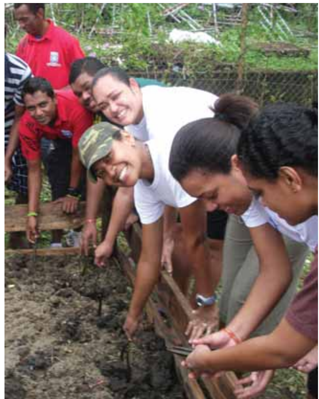
Mangrove seedling planting at Lami Town Council Depot nursery.

Lami Town Council has recognised the importance of fostering climate change awareness within its community by taking ownership of the vulnerability assessments and developing cost effective adaptation measures to create a resilient and green Town.