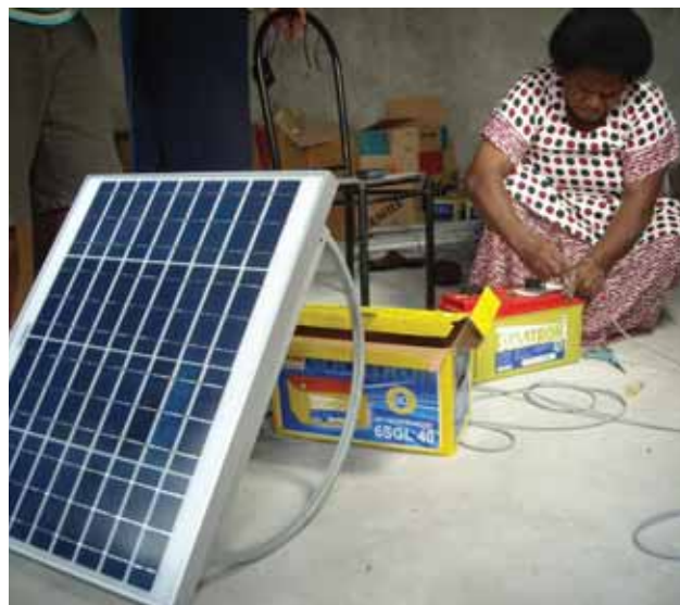
Solar panel for the dryer.

Working in partnership, including grass roots women's groups and communities, including private sector experts, national and provincial government, regional technical agencies and international development partners can add value and provide insight towards successful outcomes.