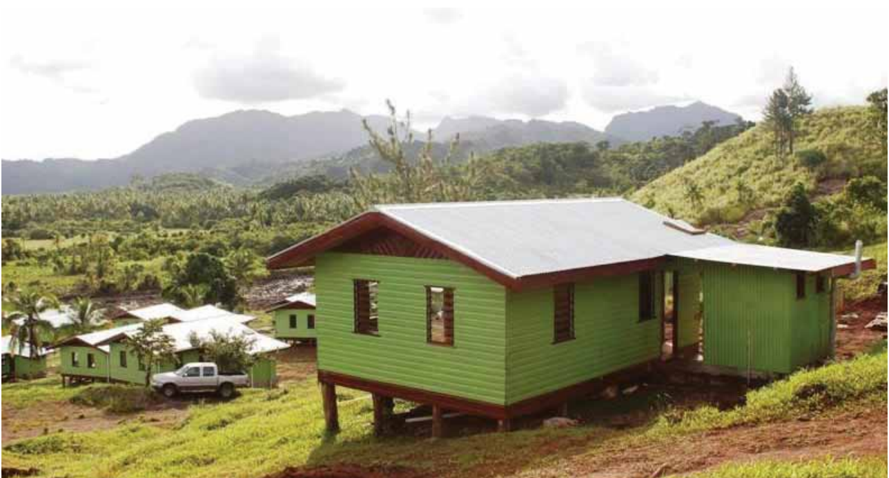
Relocated Vunidogoloa village in Vanua Levu, Fiji.

The Government of Fiji is looking at long-term solutions and has shown genuine concern for the plight and welfare of its people.