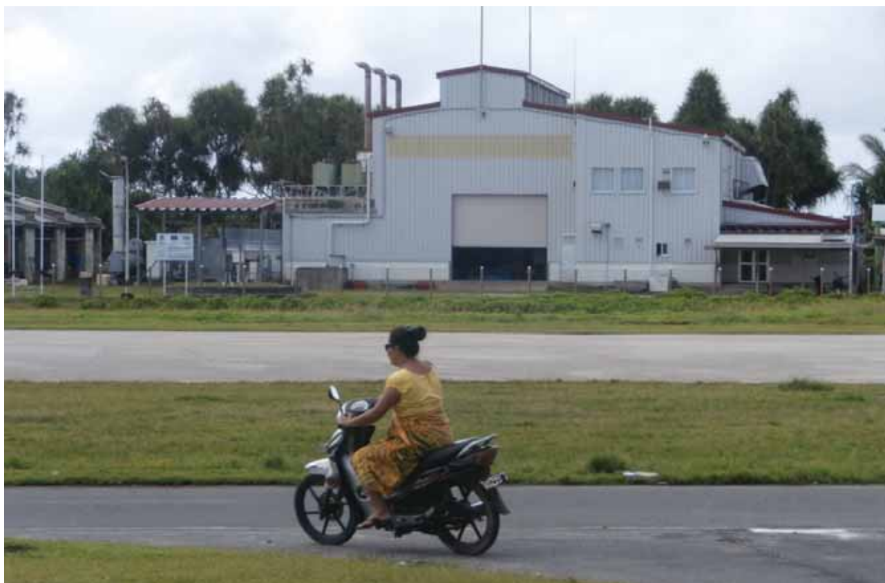
Tuvalu Electricity Corporation.

For remote Pacific Island communities, hybrid solar power systems can improve daily access times to electricity which can improve education and community services. Moving away from reliance on imported diesel for electricity production increases the resilience of communities. This prevents them from being subject to fluctuating diesel prices and limited supplies during times of climate hazards, such as cyclones.