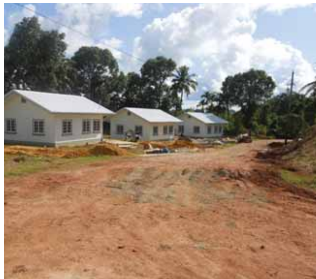
Newly constructed energy efficient housing in Palau.

Recognising that improving the efficiency of energy use has greater short term value on reducing consumption of fossil energy than any other action, the Palau National Energy Policy (2010) states that energy efficiency standards for new buildings and renovations, including homes, businesses and government premises are to be introduced. The policy target is set at a 30% reduction in overall national energy consumption by 2020.