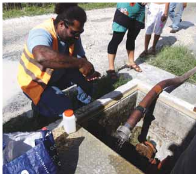
Monitoring the water supply system in New Caledonia.

The Reducing Public Health Risk in New Caledonia through Water Safety Planning Project aimed to enhance country capacity to reduce drinking water sanitary risk and work with municipalities to be more attuned to sanitary risk with tools and support to reinforce the safety of their drinking water.