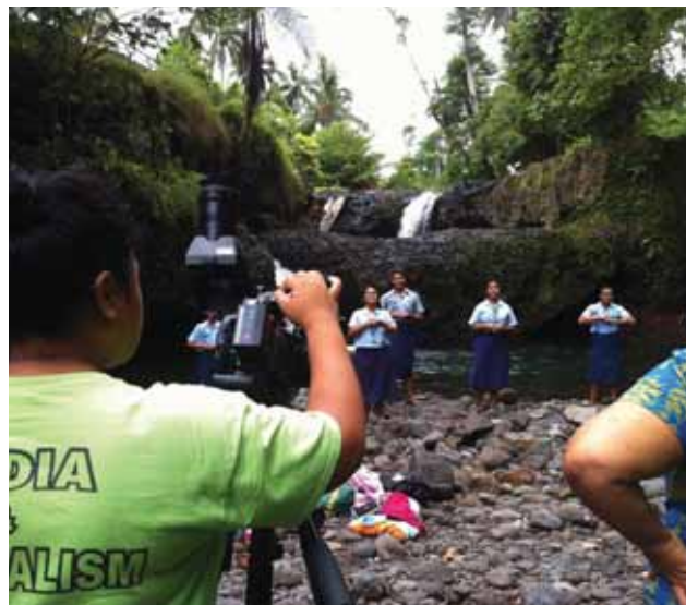
Students from Loto Taumafai, a school for students with disabilities in Apia Samoa, filming on set.

As youth are the future leaders of PICs, there is a long-term benefit in developing their knowledge and understanding of the climate change issues that will impact future generations. In addition, over half of Pacific Islanders are under the age of 24 and yet they are often not included in the conversations and decisions about climate change responses and solutions. Women and persons with disabilities also represent groups whose voices are not often heard in climate change discourse. The PACMAS Action Against Climate Change (A2C2) initiative targeted youth, women and persons with disabilities to tell their stories on DRR and climate change. The project aimed to increase awareness and knowledge of climate science, impacts and adaptation options, and communicate local home-grown solutions for climate change and DRR to encourage positive influence on policy.