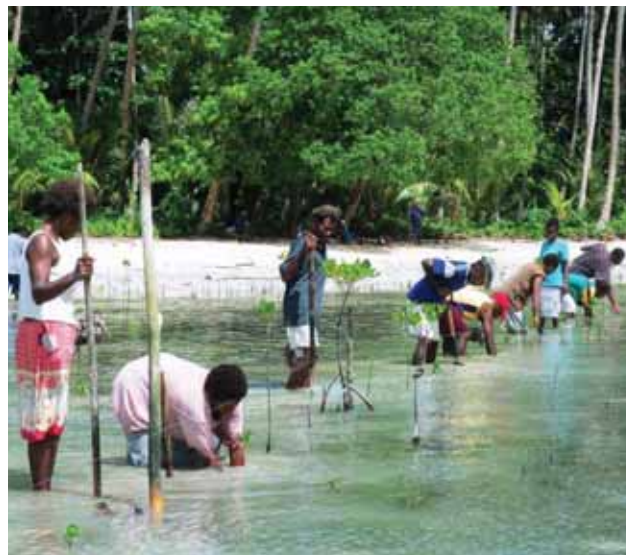
Villagers planting mangroves in Ngwawa Village, Solomon Islands, as part of their climate change adaptation activities.

The main purpose of the USP EU GCCA program is to develop and strengthen the capacity to adapt to the impacts of climate change of countries identified in the African, Caribbean, and Pacific Group of States (ACP). This is achieved through training of national and regional experts on climate change and adaptation, as well as the development and implementation of sustainable strategies for community adaptation to climate change, based on improved understanding of impacts of climate change and variability in the Pacific region.