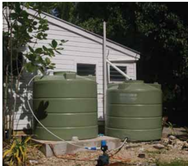
Tanks, guttering, and pipes installed on house by the PACC project.

To reduce vulnerability and to increase adaptive capacity to the adverse effects of climate change the Tokelau Pacific Adaptation to Climate Change (PACC) project objective is to contribute to reduced vulnerability and increased adaptive capacity to adverse effects of climate change in Tokelau.