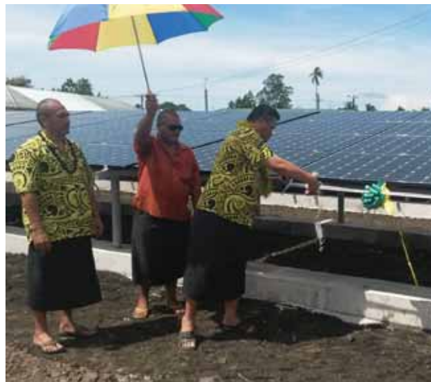
Commissioning of the Samoa grid connected PC system in Savai'i, Samoa.

Each Forum Island country is allocated an indicative amount of USD $4 million to invest in solar power generation or sea water desalination infrastructure projects, coordinated by the Pacific Islands Forum Secretariat (PIFS). In addition, countries can combine the two technologies through the installation of solar powered sea water desalination plants.