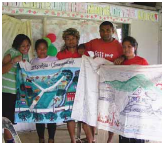
Youth workers displaying Youth Groups' community hazard and resource maps in Tongatapu, Tonga.

The programme aimed to equip youth and community workers in the Pacific with community-based DRR capacity. This included offering a 15 month Certificate in Pasifika Youth Development, including a community-based DRR component and a Diploma in Youth and Community Services. The programme seeks to develop the competencies of Pacific youth workers so that they can work effectively with young people. It also encourages young people to become agents of change in their own communities.