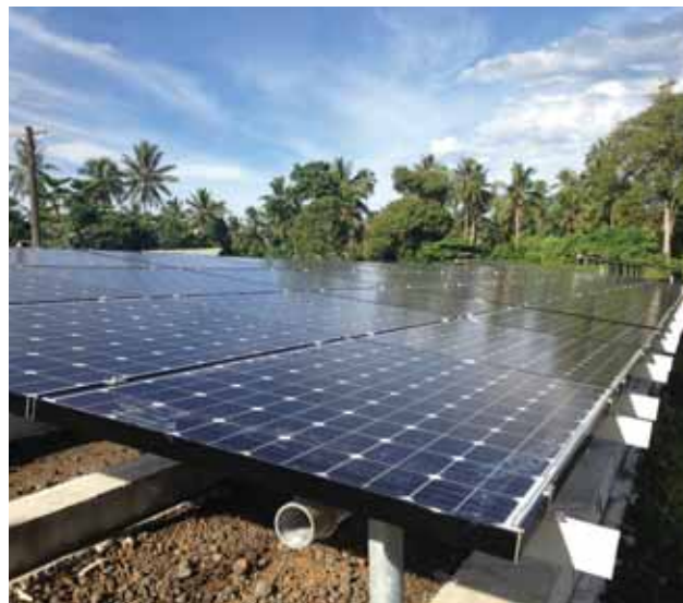
Solar PV System, Samoa.

The goal of the Pacific Island Greenhouse Gas Abatement through Renewable Energy project in Samoa, as well as in the other 13 countries that are part of the project, has been to reduce the growth rate of greenhouse gas emissions from fossil fuel use through the removal of the barriers to the widespread and cost effective use of feasible renewable energy technologies. This has, and will be, achieved by removing barriers for renewable energy technologies. For example by investing in training and capacity building in public institutions, communities and households; providing the data needed to develop renewable energies including monitoring studies, feasibility studies and other data collection.