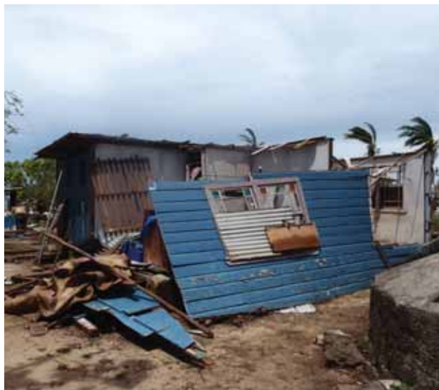
Damage after Tropical Cyclone Ian in Tonga, 2014.

This regional sovereign insurance programme is made possible through the collective efforts of the Government of Japan, the World Bank, the Global Facility for Disaster Reduction and Recovery (GFDRR), and the Secretariat of the Pacific Community (SPC). The third season for the insurance pilot programme (2014 to 2015) covers five countries (Cook Islands, Republic of Marshall Islands, Samoa, Tonga, and Vanuatu).