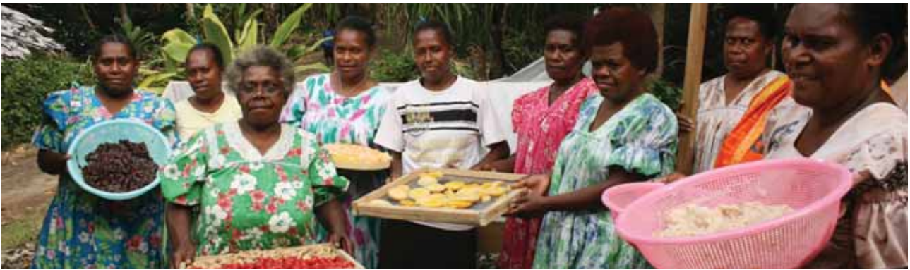
Solar Fruit Drying Training, Nguna, Vanuatu.

The participants from the Training for Trainers, immediately put their skills into practice by running a two-day introductory training course on Gender and Climate Change attended by 32 staff members from SPC, Foundation for the Peoples of the South Pacific (FSPI), Young Women's Christian Association, and Pacific Youth Council.