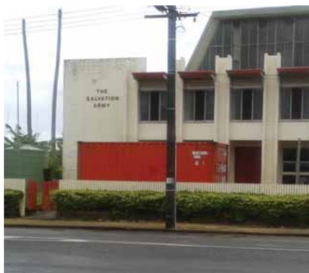
Salvation Army Evacuation Centre with container and water tank.

Education is a vital component of disaster preparedness and the definition of what needs to be included in this is continuing to widen.