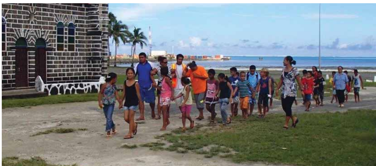
Evacuation simulation, community training.

The thorough and participatory review of response plans will impact positively on government and stakeholders to respond to disasters efficiently and in a coordinated manner. Other improvements (e.g. new equipment, broader radio coverage, and village-level preparedness for early warning and evacuation) also contribute to improved communication and local reactivity during disaster times.