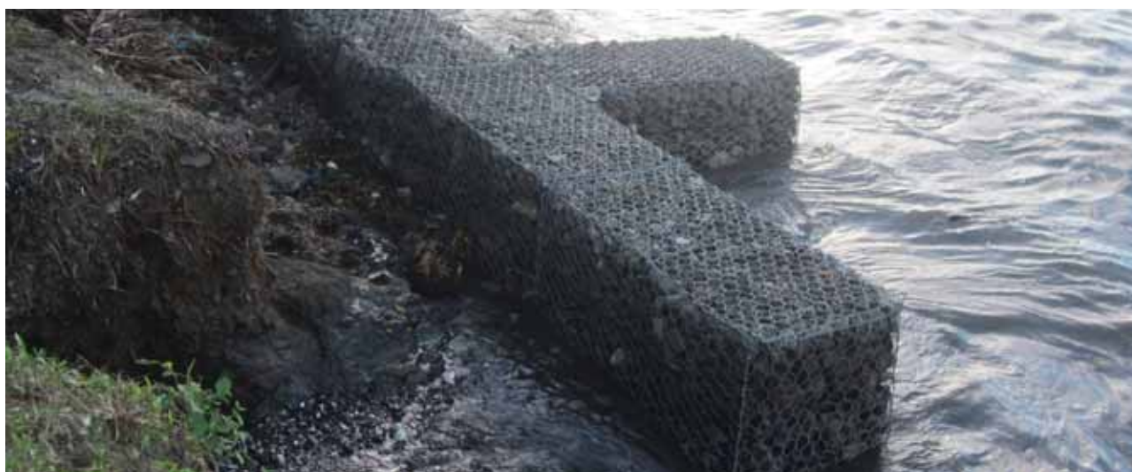
The first stage of the gabion wall to minimise storm surge impacts on the coastline.

Child representatives are very effective in educating their families, and passing on key knowledge to parents and communities about DRR and DRM. In particular, children aged 10-15 years of age should be included in all DRR meetings and trainings, and utilised as representatives and leaders in awareness-raising activities.