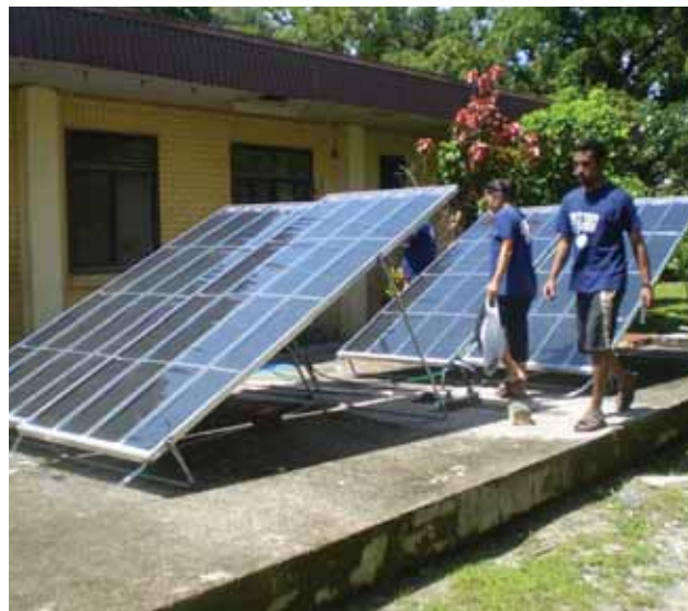
Solar panels installed for water purification in Nauru.

To reduce vulnerability and to increase adaptive capacity to the adverse effects of climate change, the Pacific Adaptation to Climate Change (PACC) programme in Nauru aimed to reduce the impacts of drought by improving management of the island's water supply.