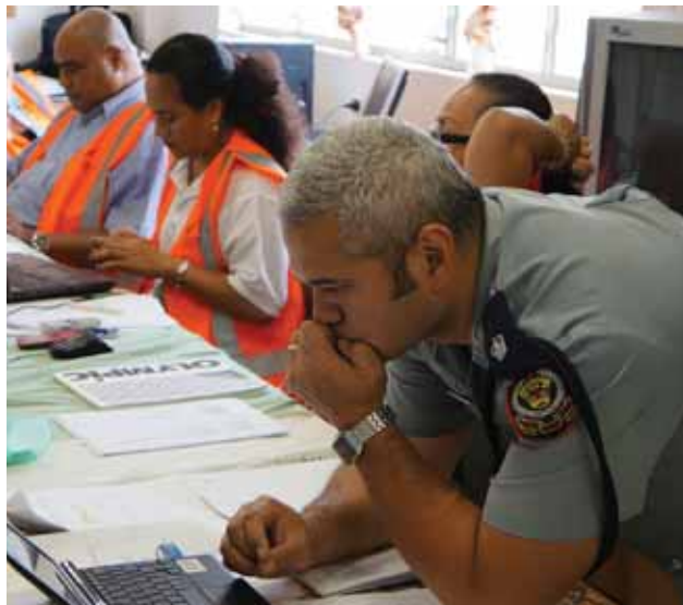
Simulation exercise 2013.

Simulation scenarios should be developed in consultation with the community well in advance of the exercise with regular meetings and ideally be based on a real event experienced by the community. This ensures the scenario is realistic and, as the community will be able to identify with the scenario, will facilitate their involvement, especially with role playing. Through this experience the community is better prepared for the next disaster event.