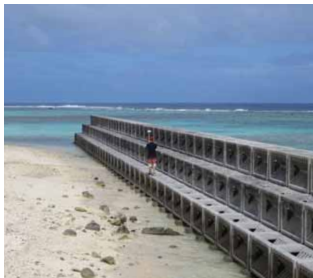
Surveying the harbour COPED Breakwater, Avarua Nikao, Rarotonga, Cook Islands.

Recognising the critical importance of the Avarua area to the economy of the Cook Islands and the urgent need to reduce the vulnerability of the area to cyclones, the Government of Cook Islands and the Water Research Laboratory (UNSW Australia) initiated the Coastal Adaptation for Extreme Events and Climate Change, Avarua, Rarotonga project. The project aimed to: understand the risk posed by changes to sea level and wave climate on coastal infrastructure and the community, particularly during extreme events; identify needs and develop options for response to the risks; and build local capacity to understand the science and manage the risk assessment and planning process.