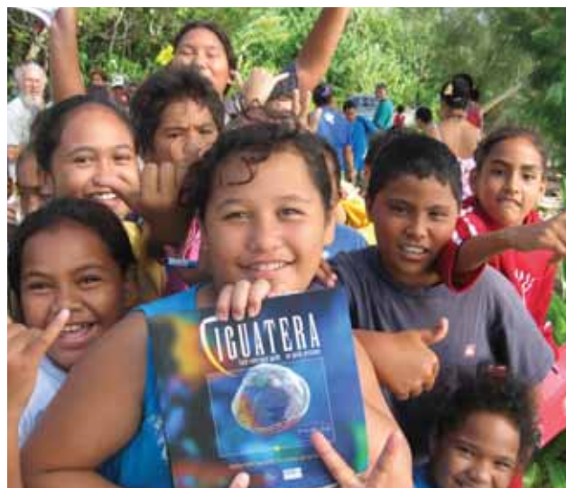
Education and public outreach actions targeted at the youth of the island of Raivavae, Australes, French Polynesia.

French Polynesia is regarded as a long-standing hotspot of Ciguatera in the Pacific. Indeed, marine products such as fish, giant clams and trochus are used as a subsistence resource by many local communities, who are therefore highly vulnerable to this hazard.