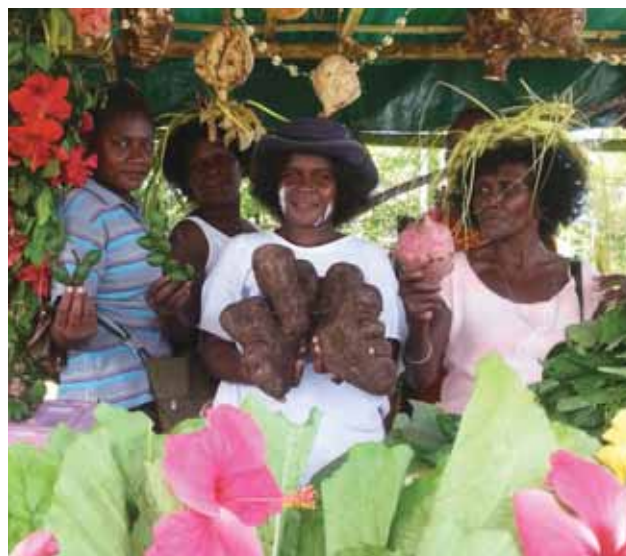
World Food Day participants in Nissan District.

The Community-Based Adaptation to Climate Change in Nissan District project aimed to increase adaptive capacity and resilience to existing hazards and the impacts of climate change on vulnerable women, men, and young people in the Nissan District through improved food security, nutrition, and DRM capacity. The project also aimed to incorporate CCA and DRM into local level planning and policy development.