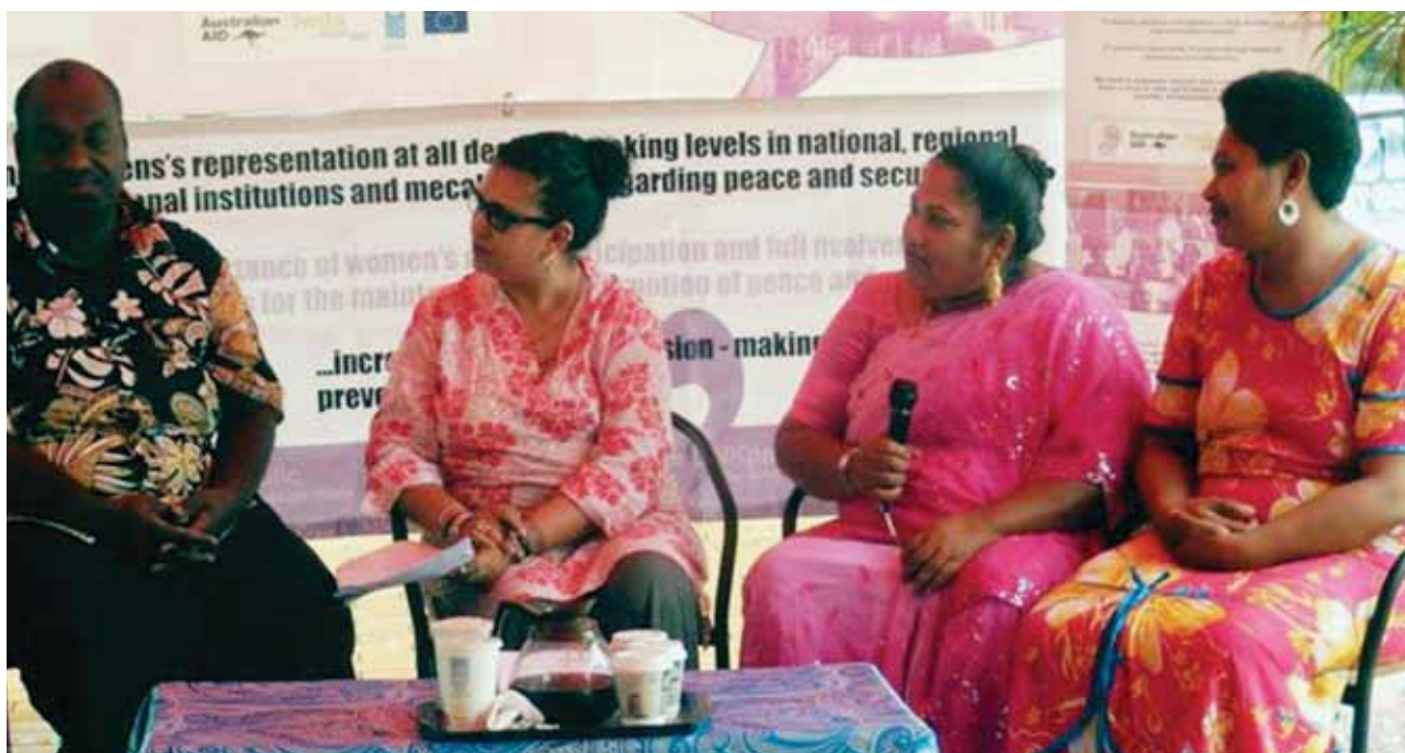
'Radio with Pictures' combined community radio broadcasts with television simulcasts to enable rural women to be seen and heard on key issues such as environmental security.

Communication strategies are important tools for community radio. They can be utilised to highlight issues related to climate change, disasters and community vulnerability.