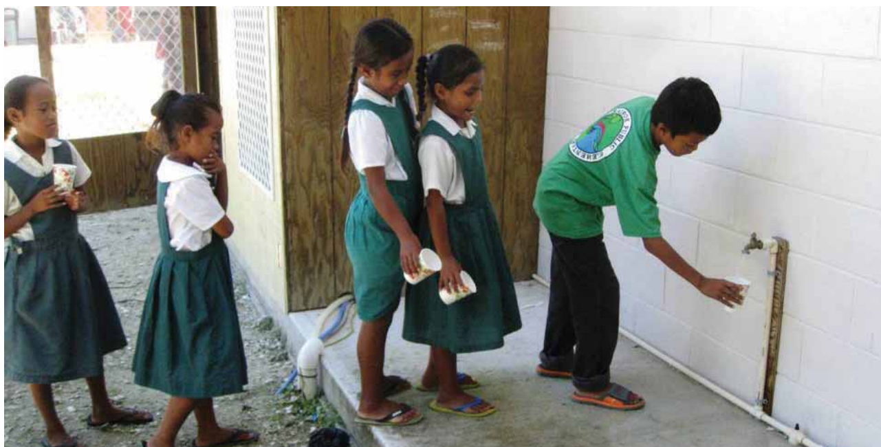
Students of Rairok Elementary School lining up for water, Republic of Marshall Islands.

The sustainability of infrastructure projects needs to be considered during the proposal development process as well as during implementation with all the relevant stakeholders to facilitate sufficient planning, commitment of resources and capacity to continue to operate and maintain the systems.