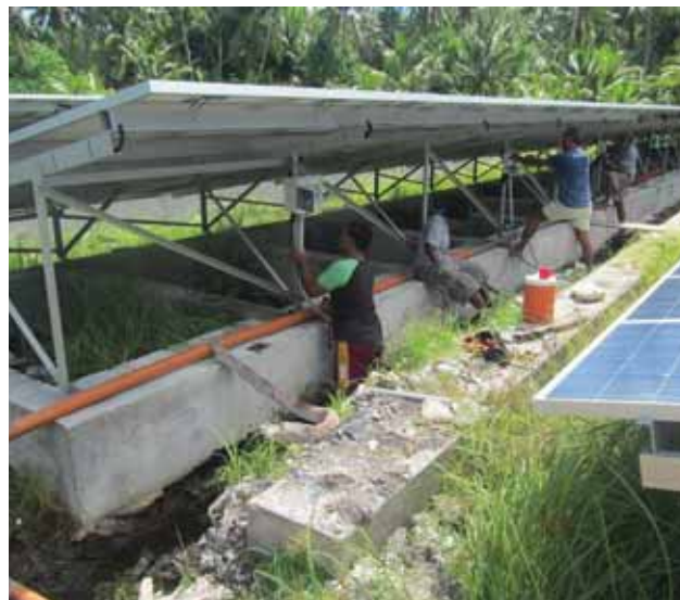
Local energy staff connecting cables on the Solar PV system.

The project was the result of a decade of preparation starting with a comprehensive national energy assessment in 2003 funded by United Nations Development Program (UNDP). This fed into a 2004 Tokelau Government policy to shift to 100% renewables in order to lower dependency on external fuels, maintain the pristine atoll environment from pollution by oil spills and diesel exhaust, and to improve energy security.