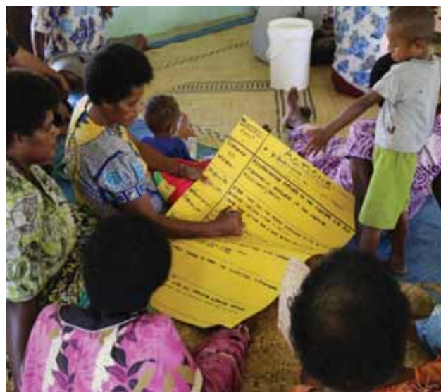
Community members discussing Disaster Response Plans.

Awareness raising is an important factor for encouraging governments and especially local communities to continue to invest not only financially, but also in kind labour for disaster preparedness.