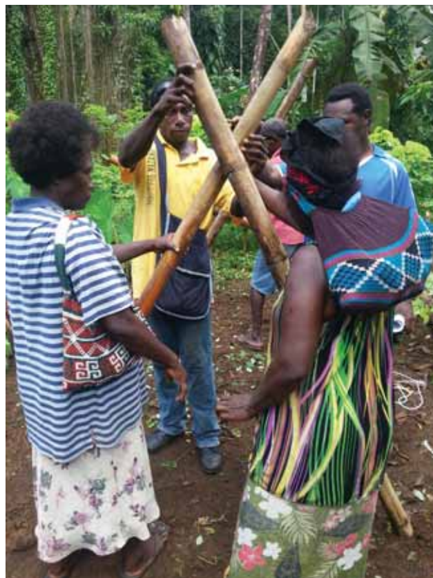
Building a verticle vegetable garden in Nissan District.

Bottom-up planning introduced by the community DRR action planning processes has been a highly effective way of identifying risks that may not have been identified using a top-down approach. For example, this process identified the increasing rarity of traditional medicinal plants, which led to collaboration with the Bougainville Traditional Health Project to promote the establishment of traditional medicinal plants in project supported nurseries to ensure they are available for future generations.