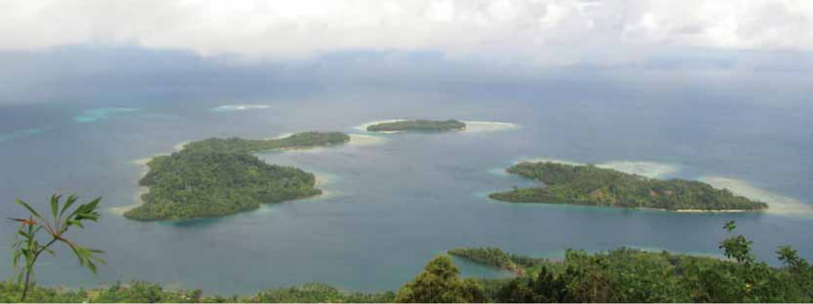
South Choiseul, Solomon Islands.