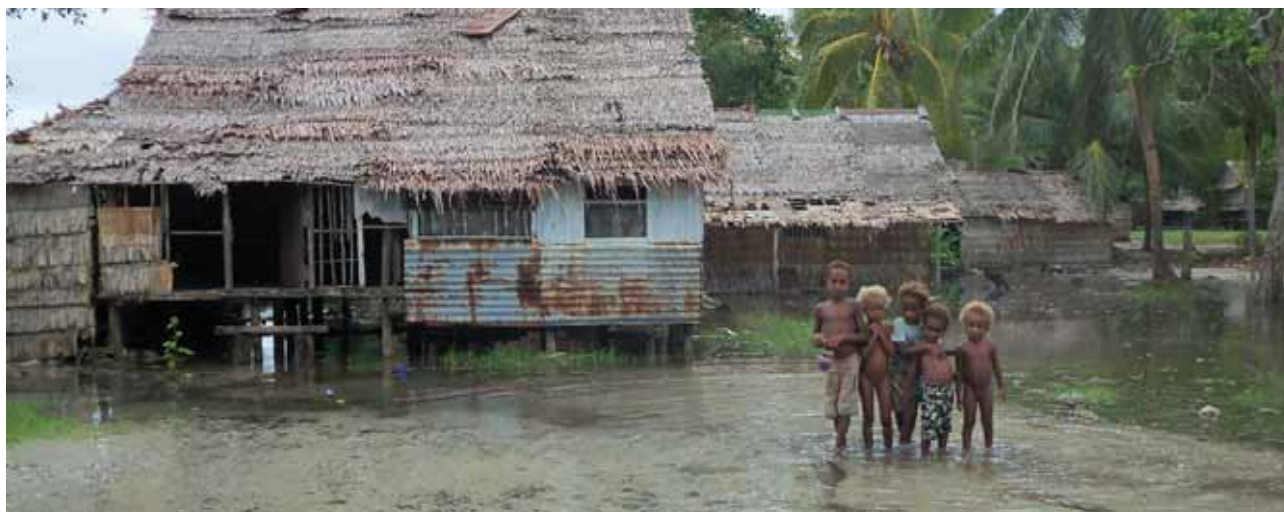
Children playing in the inundated village ground in Solomon Islands, Photo: University of the South Pacific.

These two frameworks are superseded by the Strategy for Climate and Disaster Resilient Development in the Pacific (SRDP). The strategy aims to strengthen the resilience of Pacific Island communities to the impacts of climate change and disasters by developing more effective and integrated ways to address climate and disaster risks, within the context of sustainable development.