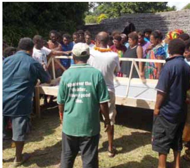
Tana community building fruit dryer, Vanuatu.

The Solar Fruit Drying initiative aims to enable women and communities to engage in an innovative, inexpensive and locally appropriate CCA strategy based on the existing gender-specific knowledge and set of skills. For example, the program allows women to further exploit and utilize the knowledge and techniques of food preservation they traditionally and culturally possess. The initiative also aims at empowering women financially, by providing a source of revenue-generating value-added dried products. Fresh produce is nearly impossible to market from many remote isolated islands, while dried products can be stored and sold whenever a ship reaches these women.