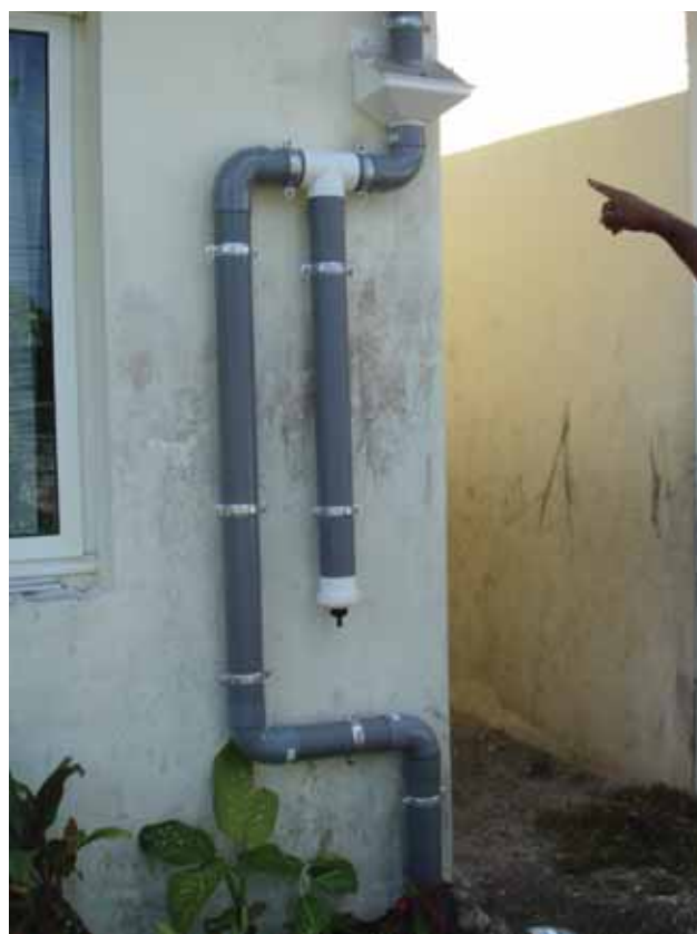
Newly installed water residential water system, New Caledonia.

The water safety planning approach develops a culture to ensure monitoring of water quality, maintaining infrastructure, and reducing wastage. This reduces public health issues building the resilience of communities.