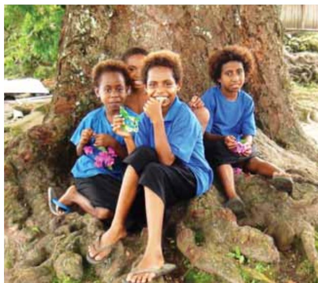
Krangket Elementary School girls, Papua New Guinea.

The 4CA model builds on Plan International's child-centred DRR model for communities vulnerable to disaster and climate change. The programme has a focus on vulnerable communities in coastal and remote areas.