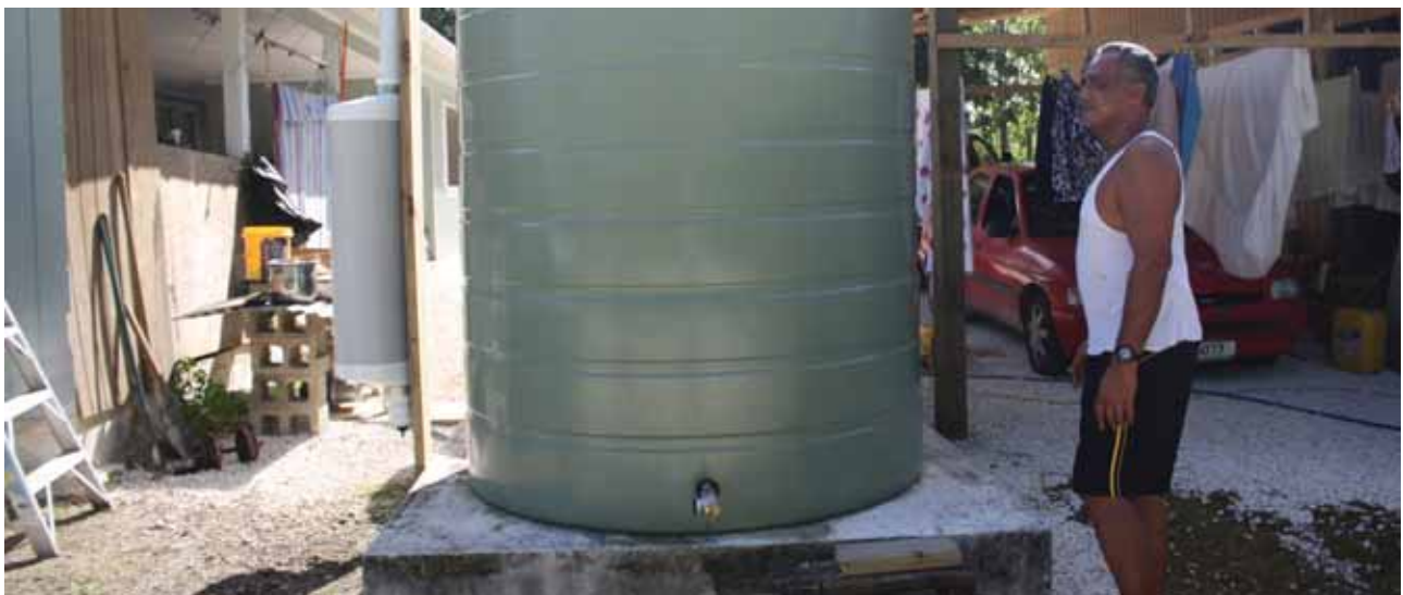
Installed water tank, Niue.

Making householders responsible for maintenance of the system and contributing to the cost strengthens ownership and adds to sustainability of water security outcomes.