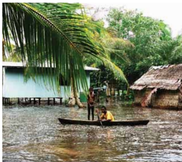
King tide flooding the village.

Based on experiences from existing 'in-country' local climate change networks, it can be seen that they can improve the sharing of information and best practices amongst Pacific Island communities. Participants of the local climate change networks are motivated to work together because they want to be able to take actions that have a high chance of measurable, long-term success. For example, a network is proposed to create a multiplier effect among communities not covered by the project, which will gain knowledge and skills from their exposure to locally-managed concepts on adaptation to climate change.