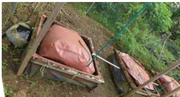
Samoa is developing its first ever biogas system for electricity generation. The project will use green waste, such as invasive vines, as fuel.

Utilisation of renewable energy reduces greenhouse gas emissions and improves resilience of communities by reducing reliance on external energy sources and the impacts of price fluctuations.