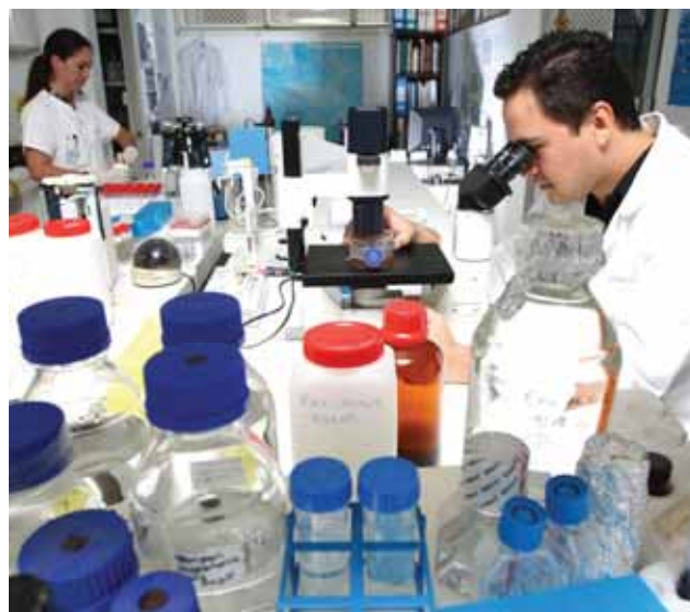
Development of refined laboratory in vitro tests routinely used at Institut Louis Malarde, Tahiti, French Polynesia, for the detection of seafood at risk of Ciguatera.

There is an urgent need for a policy to support all government measures aiming at the development of remote islands, to reduce impacts on the complex and fragile ecosystems of the islands in French Polynesia and across the Pacific. There is also a need to strengthen information, education and public outreach actions for a better prevention of populations.