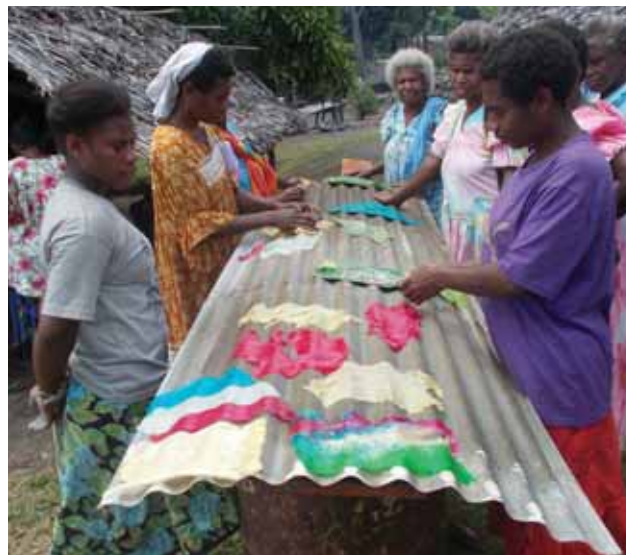
Tanna women drying manioc, Vanuatu.

This toolkit focuses on programme managers and supporting them in the understanding of the importance of gender and social inclusion to achieve project outcomes.