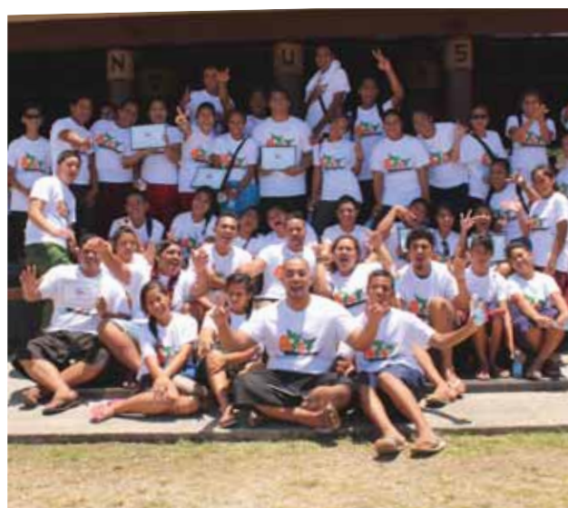
Students from Samoa celebrate the final A2C2 showcase event at the National University of Samoa.

Awards for climate change and journalism/media are a useful mechanism to facilitate exposure to climate change in the university and school curriculum, and encourage youth to explore future careers in climate change and/or media.