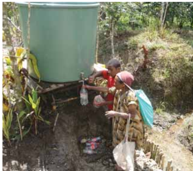
Youth volunteers construct bamboo aqueduct, March 2010.

Alex Dui, a Red Cross youth volunteer with the Western Highlands Province Branch of the Papua New Guinea Red Cross Society worked with a diverse group of village members to build on traditional leadership processes and facilitate the development of community projects, including building a water supply system and then re-building it to improve access to a cleaner water source. Alex's initiative as a Red Cross volunteer set off a chain reaction of inclusive participation and vulnerability reduction that has become a part of the culture of Kindau.