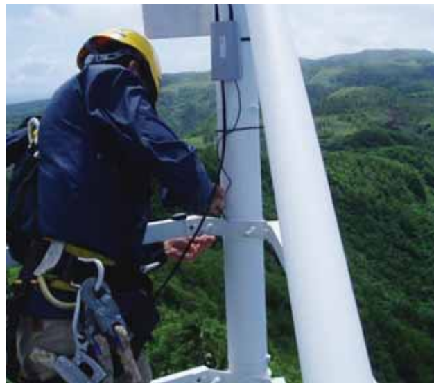
Network installation services by Radiocom, Futuna.

In order to do this, more accurate assessment of the tsunami hazard was required. The Secretariat of the Pacific Community (SPC), in partnership with the National Institute of Water and Atmospheric Research New Zealand and the French Institute of Research for Development provided Wallis and Futuna with critical information to support tsunami planning. This included inundation maps outlining zones at risk and reaction time based on specific tsunami scenarios. The project aimed to improve the territory's capacity to manage disaster situations and falls under Wallis and Futuna's long-term efforts to improve civil security following significant damage on Futuna after Tropical Cyclone Thomas which hit the territory in March 2010.