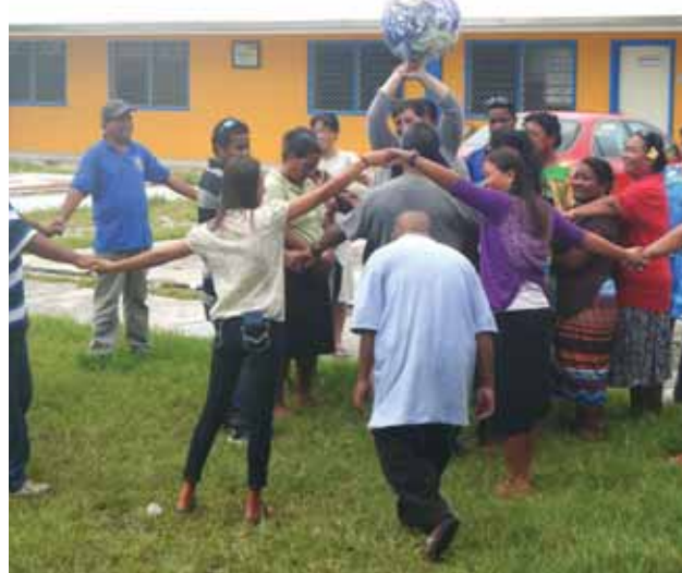
Science teacher training in the Republic of Marshall Islands.

Focus group sessions identified that beneficiaries most appreciated the Emergency Response Training and Medical Kits for schools, the co-teaching model where trainers visit classrooms and work together with local teachers in delivering CCA and DRR lessons, and participatory process that led to community driven projects.