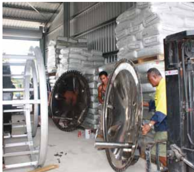
Tank moulding plant developed to produce water tanks in Niue.

With funding available from the Pacific Adaptation to Climate Change (PACC) programme and the Global Climate Change Alliance (GCCA:PSIS) project, Niue embarked on an ambitious programme to provide an alternative water source. Rainwater harvesting was identified as the most suitable option for strengthening water security in Niue.