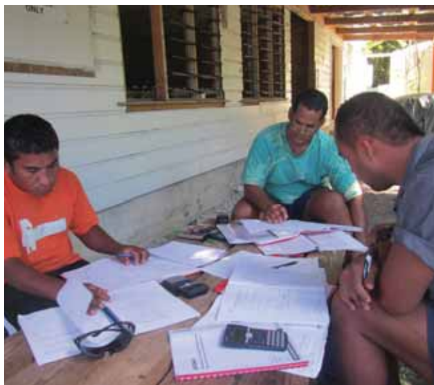
Tokelau Energy Team on their study time. This is part of ongoing training to increase local capacity on the maintenance of Solar PV systems.

http://www.irena.org/DocumentDownloads/events/Workshop_Accelerated_Renewable_Energy_Deployment/Session7/S7_1Forumpresentation2.pdf http://tokelau.org.nz/site/tokelau/files/NEPSAP%20Main%20Text.pdf