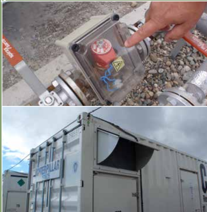
Adaptations to protect GenSet equipment in Bariloche, Argentina, from repeated airborne ash exposure following 2011-2012 eruption of Cordon Caulle volcano, Chile. Top: sealed fuel valve. Bottom: hood to protect air intake.

See companion posters on “Advice for Power Transmission and Distribution System Operators” and “Advice for Power Station Managers” for additional information on effects of ash on power supply systems